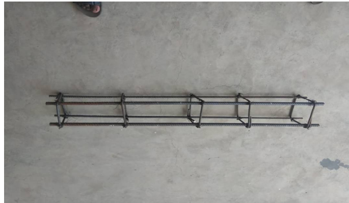
Fig 1 Reinforcement cage