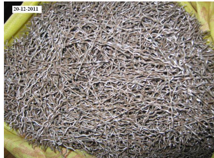
1. Steel fiber

Material: Cold-drawn steel wire, with deformed ends. Conformance: ASTM A 820/A 820M, Type I. Fire Classification: UL Report File No. R14701 (N). Tensile Strength: Minimum 152,000 psi (1,050 MPa). Fiber Length: 2 inches (50 mm). Equivalent Diameter: 0.039 inch (1.0 mm). Aspect Ratio: 50. Appearance: Bright and clean wire.