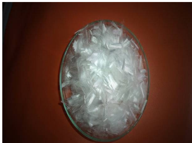
2. Polypropylene fiber

Product :Fibrillated (mash) Polymer :100% virgin polypropylene homo polymer Fiber Length:10-12mm Melting Range:165 degree celsius Thermal and electrical conductivity : low Colour :Natural Specific Gravity: 0.91