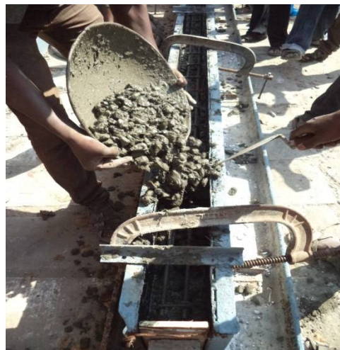
Fig 2 Applying on the concrete