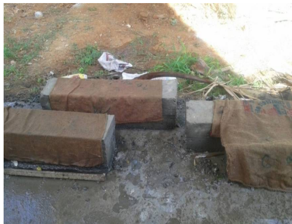
Fig 3 curing of concrete