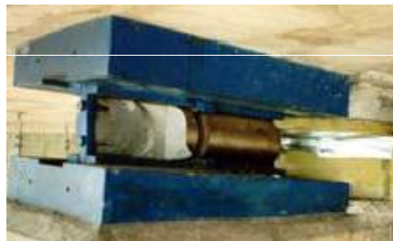
Fig. Steel Roller Bearings