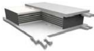
Fig. Elastomeric Bearings