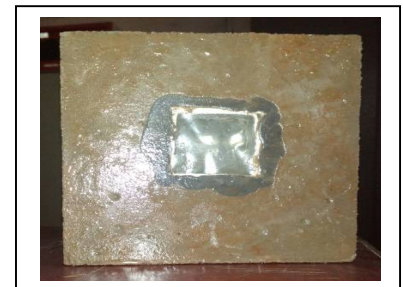
Figure 1 Light transmitting concrete