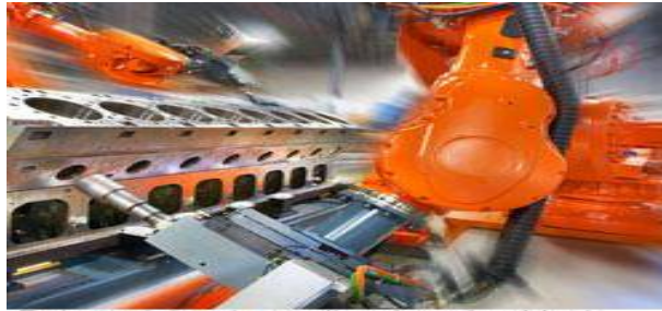
Robots deburring a diesel engine block.