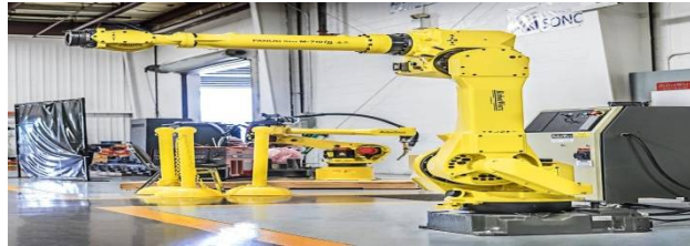
The FANUC M-710iC/70 Brings Fast Speeds and Reliability

The FANUC M-710iC series was engineered to bring users high speeds, maximum flexibility, and reliability that covers a wide range of applications. The series includes eight medium payload robots with a slim wrist, small footprint, and payloads ranging from 12 - 70 kg and reach up to 3.1 meters. It brings the heavy 70 kg lifting along with the high axis speeds and rigid arm. It can be mounted on the ceiling or at an angle and reach overhead and behind providing one of the largest work envelopes in its class. It has a wide motion envelope and enough wrist load capacity to handle a large panel.