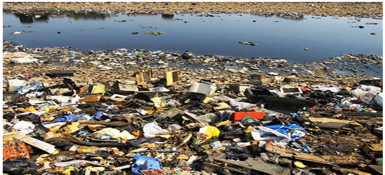
Fig.3Heavy metals leach through the soil to reach groundwater channels which eventually run to the surface as streams or small ponds of water.

Effects on water- When electronics containing heavy metals such as lead, barium, mercury, lithium (found in mobile phone and computer batteries), etc., are improperly disposed, these heavy metals leach through the soil to reach groundwater channels which eventually run to the surface as streams or small ponds of water. Local communities often depend on these bodies of water and the groundwater. Apart from these chemicals resulting in the death of some of the plants and animals that exist in the water, intake of the contaminated water by humans and land animals results in lead poisoning. Some of these heavy metals are also carcinogenic.