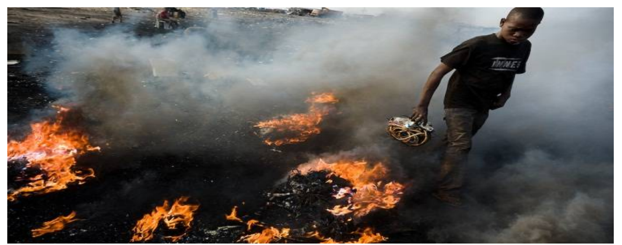
Fig.2 Burning of electronic device for extracting of metals.

Effects on air- One of the most common effect of E-waste on air is through air pollution. For example, a British documentary about Lagos and its inhabitants, called Welcome to Lagos, shows a number of landfill scavengers who go through numerous landfills in Lagos looking for improperly disposed electronics which includes wires, blenders, etc., to make some income from the recycling of these wastes. These men were shown to burn wires to get the copper (a very valuable commodity) in them by open air burning which can release hydrocarbons into the air.