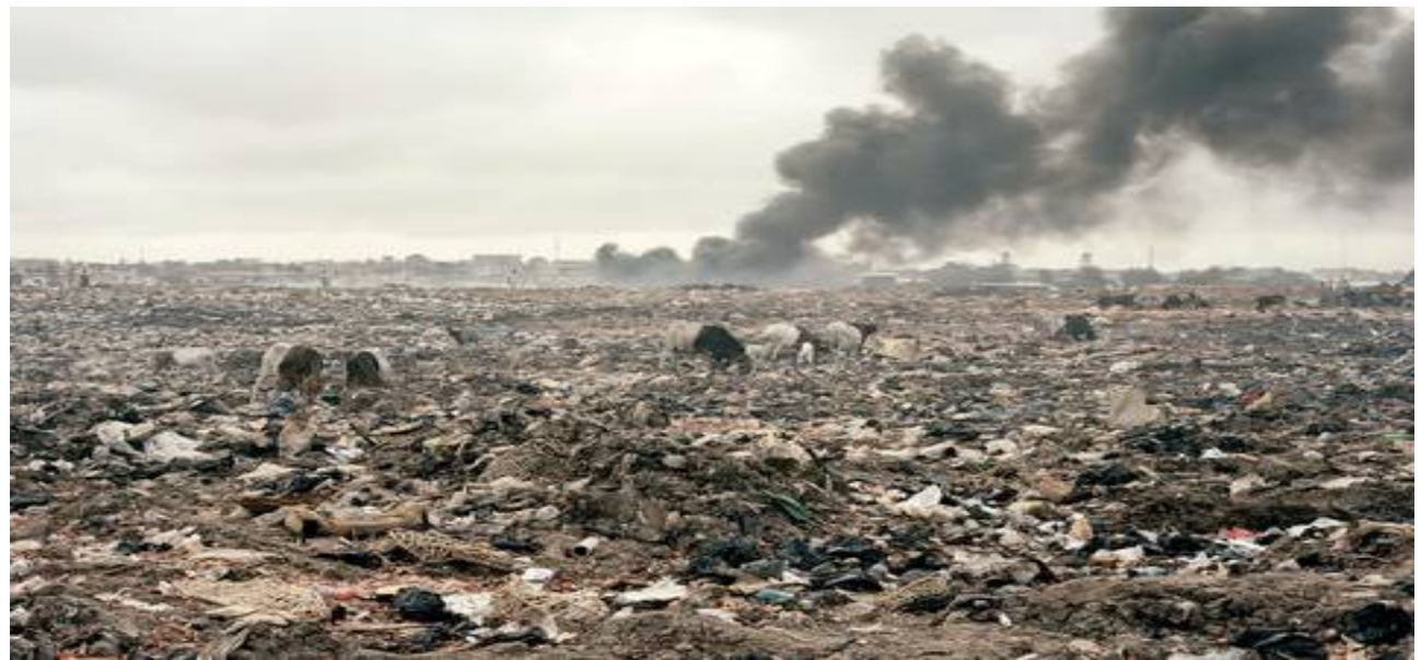
Fig.4Because of Heavy metals leach through the soil and burning of electronic device soil loss its fertility.

Visit: <u>www.ijirset.com</u> Vol. 7, Issue 5, May 2018