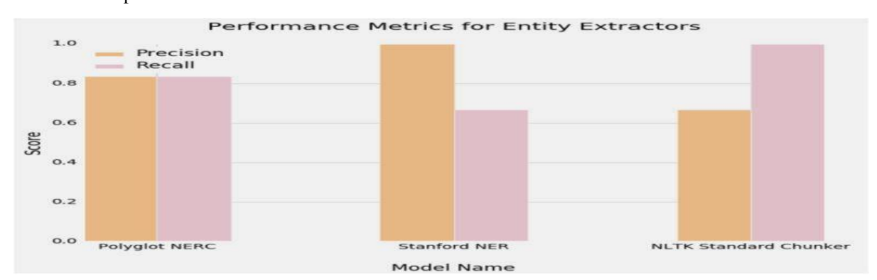
Fig.2 Performance metrics for entity extractors