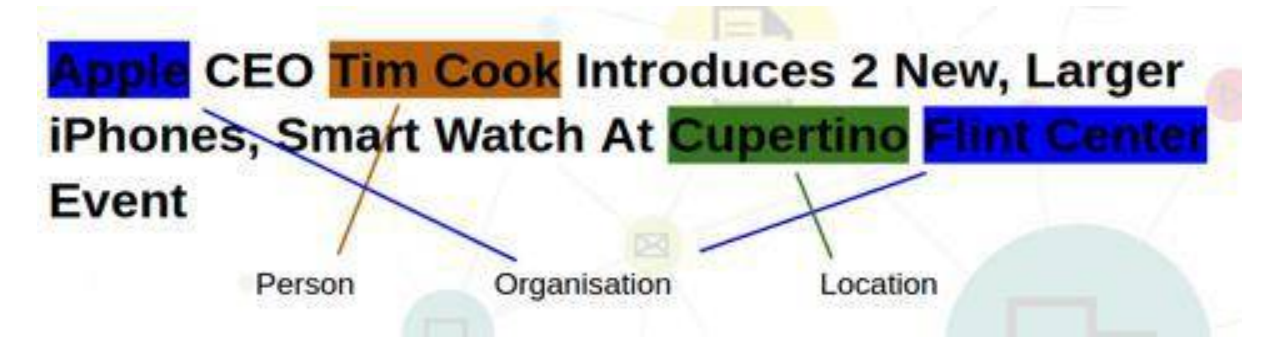
Fig:1 An example for named entity recogonisation.

Text classification problems and algorithms have been around for a while now. The performance of a text classification model is heavily dependent upon the type of words used in the corpus and type of features created for classification. Text based data mining and information extraction systems that make use of of machine learning techniques required for annotating datasets for training the algorithm. This machine learning approach is to be done with R programming which is a powerful language for data analysis.