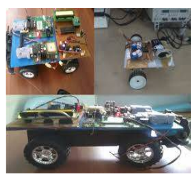
In Fig.1Protocol of Metal Detecting Robot.