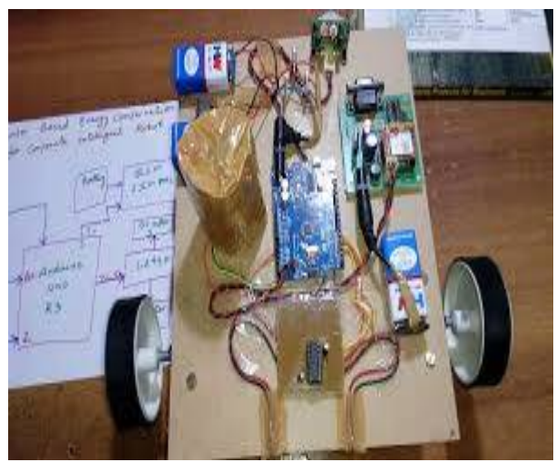
In Fig.2.In this project we use this hardware description to controlled Metal and Gas Detection Robot by using protocol.