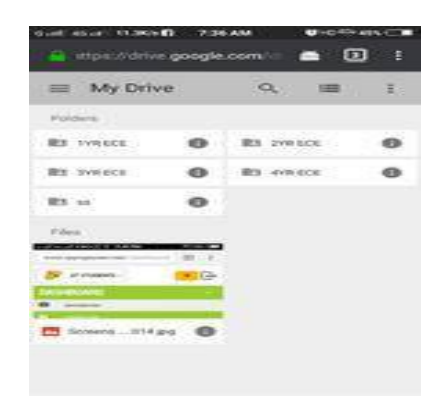
Fig 3 Create a cloud memory