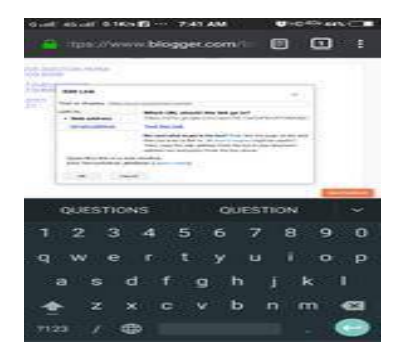
Fig 6 Create android application.