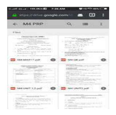
Fig 5 Create blogger and attach a document link