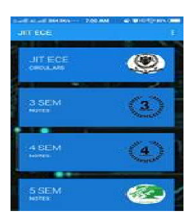
Fig 4 Upload the document in cloud