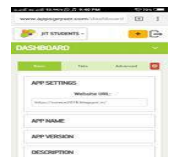
Fig 7 Android application mobile view