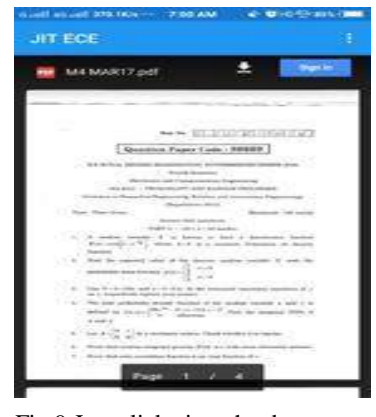
Fig 9 Just click view the document