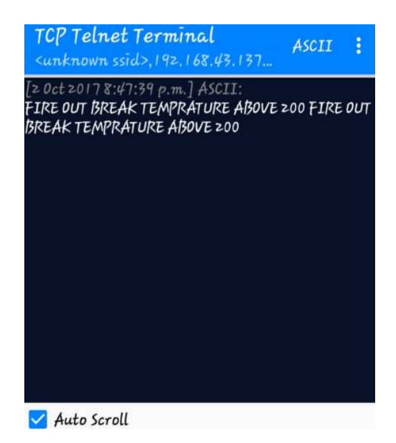
Fig 8.1 output of fire alerting system