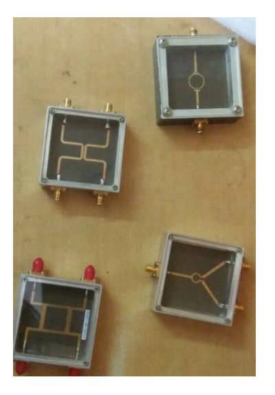
Fig 4: Microstrip elements

Thus the antennas are very much important in communication. In mobiles there are almost two or three antennas. Everyone has its own purpose. One for Bluetooth, other for Wi-fi, and other for transmitting, and another one for both transmit and receive etc.. The antennas that are been manufactured are dipole antenna, monopole antenna, patch antenna in which there are some types again, yagiuda antenna, horn antenna, array antenna, smart antenna etc.. The other components have also been designed using the microstrip methodology.