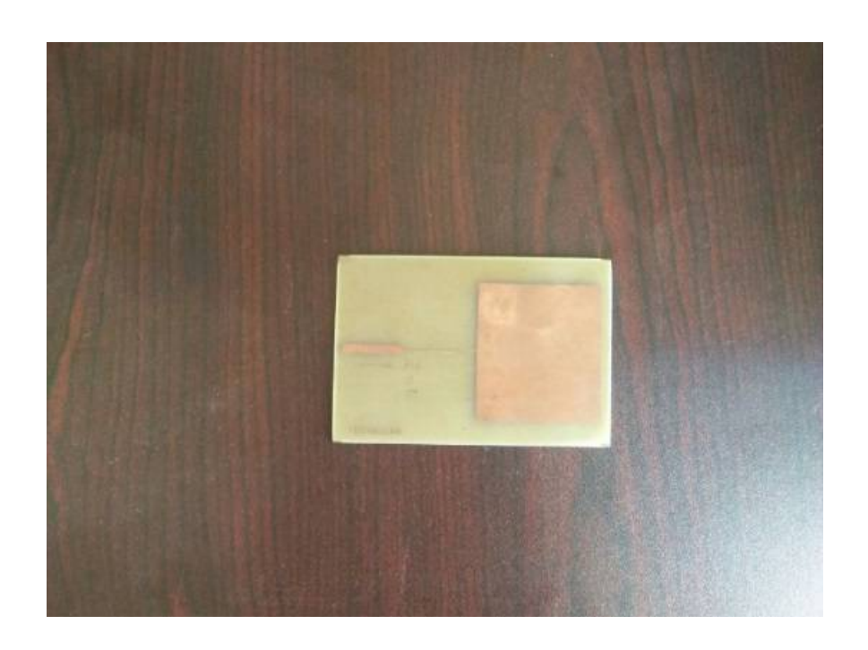
Fig 2: Microstrip Monopole antenna