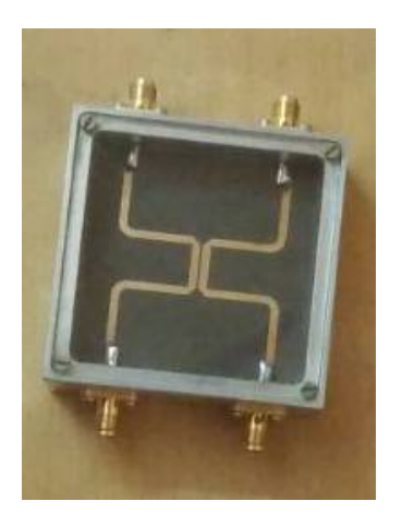
Fig 3: Microstrip branch line coupler

Department of ECE, Adhiyamaan College of Engineering, Hosur, Tamilnadu, India