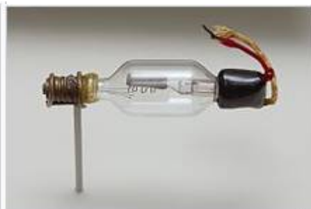
De Forest Audion tube from 1908, the first triode. The flat plate is visible at top, with the zigzag wire grid under it. The filament was originally under the grid but has burned out.