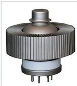
The 3CX1500A7, a modern 1.5 kW power triode used in radio transmitters. The cylindrical structure is a heat sink attached to the plate, through which air is blown during operation.