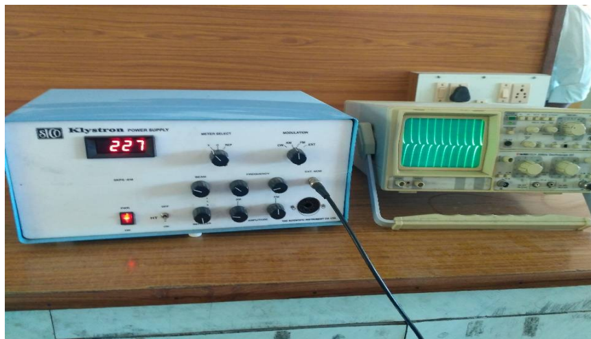
Fig 5: Output waveform 1

In order to evaluate the performance of the surface the defects detection system, experiment sare carried out using the real-time An electronic oscillator can be made from a klystron tube, by providing a feedback path from output to input by connecting the "catcher" and "buncher" cavities with a coaxial cable or waveguide. When the device is turned on, electronic noise in the cavity is amplified by the tube and fed back from the output catcher to the buncher cavity to be amplified again. Because of the high Q of the cavities, the signal quickly becomes a sine wave at the resonant frequency of the cavities.