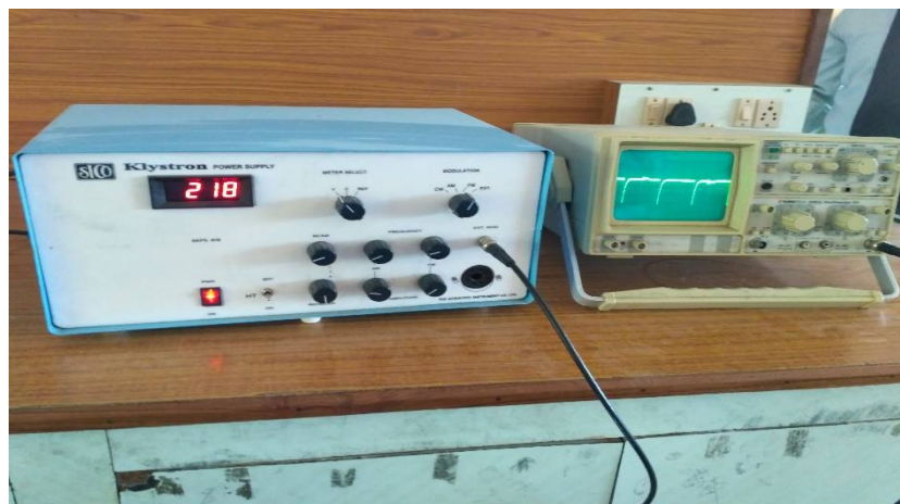
Fig 6: Output waveform 2

There is also a special feature in this system that is it will capture all the images of the moving metals if they get detected and then it will also calculate the values of the metals that get detected and it shows in the display as shown in figure 5 and 6.