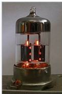
ECC83, a dual triode used in 1960-era audio equipment

A triode is an electronic amplifying vacuum tube (or valve in British English) consisting of three electrodes inside an evacuated glass envelope: a heated filament or cathode, a grid, and a plate (anode). Developed from Lee De Forest's 1906 Audion, a partial vacuum tube that added a grid electrode to the thermionic diode (Fleming valve), the triode was the first practical electronic amplifier and the ancestor of other types of vacuum tubes such as the tetrode and pentode. Its invention founded the electronics age, making possible amplified radio technology and long-distance telephony. Triodes were widely used in electronics devices such as radios and televisions until the 1970s, when transistors replaced them. Today, their main remaining use is in high-power RF amplifiers in radio transmitters and industrial RF heating devices. In recent years there has been a resurgence in demand for low power triodes due to renewed interest in tube-type audio systems by audiophiles who prefer the sound of tube-based electronics.