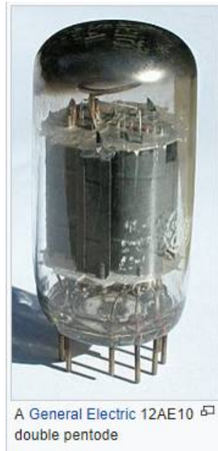
Fig3:A general electric pentodemodel