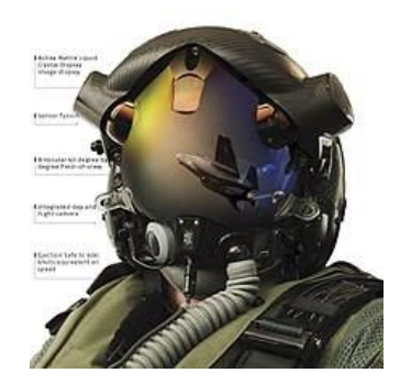
Fig 11 Helmet-Mounted Display System for the F-35 Lightning II Joint Strike Fighter

An ISO 3297: 2007 Certified Organization