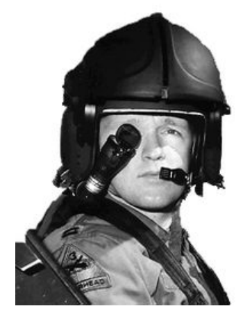
Fig 9 IHADSS

In 1988the U.S. Army fielded the AH-64 Apache and with it the Integrated Helmet and Display Sighting System (IHADSS), a new helmet concept in which the role of the helmet was expanded to provide a visually coupled interface between the aviator and the aircraft. The Honeywell M142 IHADSS is fitted with a 40° by 30° field of view, video-with-symbology monocular display. IR emitters allow a slewable thermographic camera sensor, mounted on the nose of the aircraft, to be slaved to the aviator's head movements. The display also enables Nap-of-the-earth nightnavigation. IHADSS is also used on the Italian Agusta A129 Mangusta.