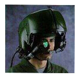
Fig 4 Modern US Army Apache helmet

Fig 3 Soviet MiG-25 pilot helmet of the 1980s