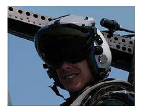
Fig 10 JHMCS

JHMCS is a derivative of the DASH III and the Kaiser Agile Eye HMDs, and was developed by Vision Systems International (VSI), a joint venture company formed by Rockwell Collins and Elbit (Kaiser Electronics is now owned by Rockwell Collins). Boeing integrated the system into the F/A-18 and began low-rate initial production delivery in fiscal year 2002. JHMCS is employed in the F/A-18A++/C/D/E/F, F-15C/D/E, and F-16 Block 40/50 with a design that is 95% common to all platforms<sup>-</sup>