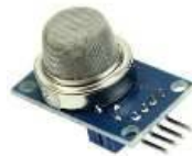
Fig 3 C02 Sensor

MQ-6 is the sensitive component and has a protection resistor and an adjustable resistor on board. The MQ-6 gas sensor is highly sensitive to LPG, iso-butane, and propane and less sensitive to alcohol, cooking fume and cigarette smoke.