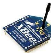
Fig 2 zigbee

ZigBee is an IEEE 802.15.4 based specification for a suite of high level communication protocols used to create personal area networks with small, low-power digital radios. The technology defined by the ZigBee specification is intended to be simpler and less expensive than other wireless personal area networks (WPANs), such as Bluetooth or Wi-Fi.