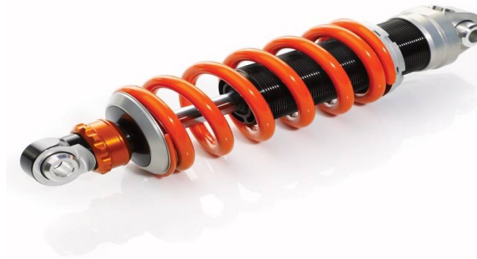
Figure 1: conventional suspension system