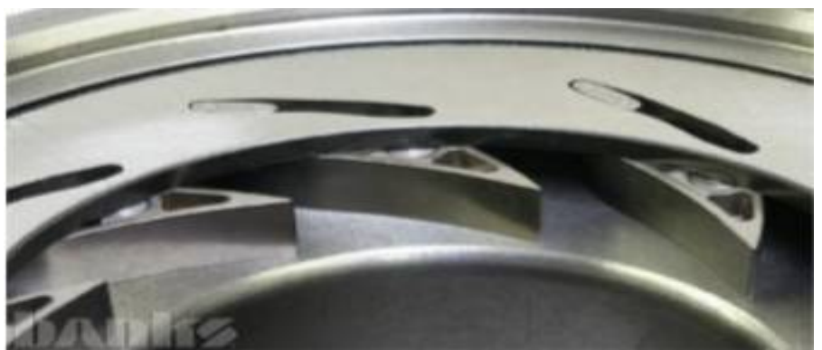
Fig.4. Vanes Open

A turbocharger equipped with Variable Turbine Geometry has little movable vanes which can direct exhaust flow onto the turbine blades. The vane angles are adjusted via an actuator. The angle of the vanes varies throughout the engine RPM range to optimize turbine behaviour.