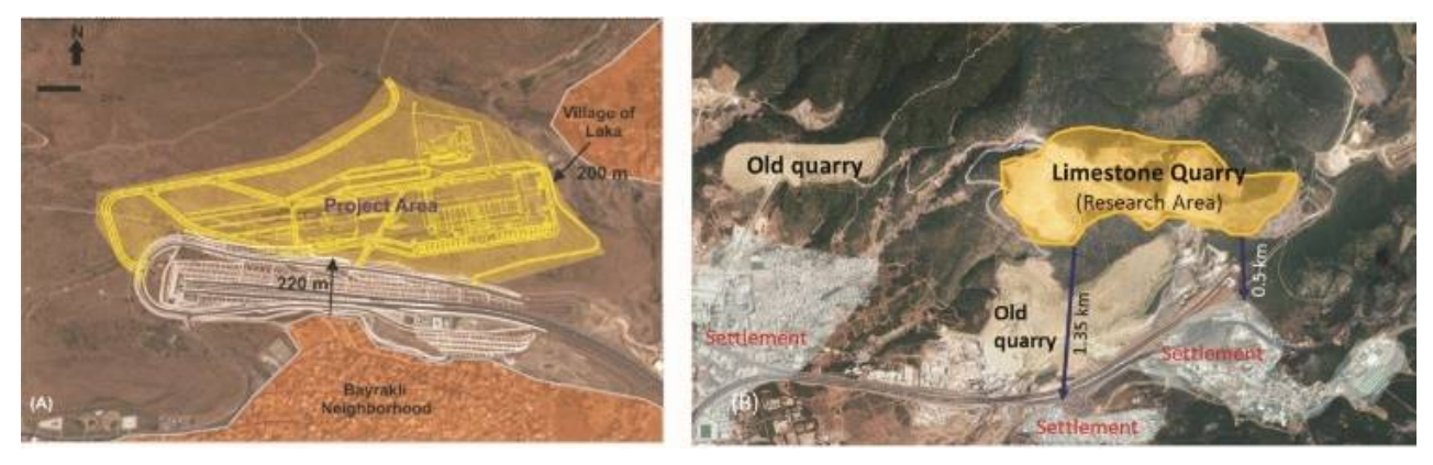
Fig 1 Location of areas and Settlements (A) Explosive-assisted excavation area (B) Limestone quarry

Visit: <u>www.ijirset.com</u> Vol. 7, Issue 10, October 2018