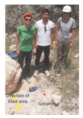
Fig 2 Some of volunteers near geophone

A survey was developed in order to determine the perception of blast-induced vibration and the effect of gender on perceived vibration. This survey was where conducted so as to exclude daily activities noise and vibrations, in other words, the survey was conducted at a geophone measurement points on a rock mass (Fig.2). So people's reactions can be objective when other environmental noise and vibration is much less.