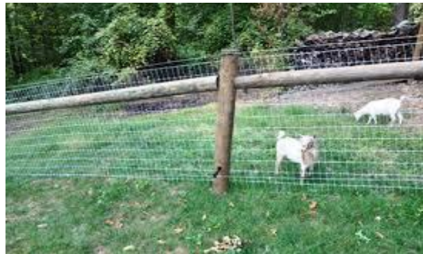
Figure 2 Farm Fencing