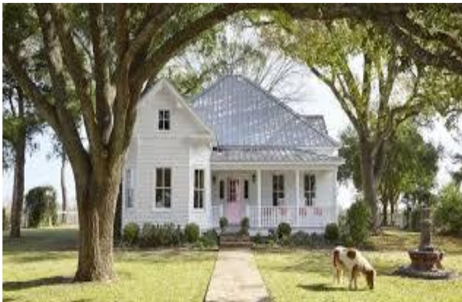
Figure 1 HOUSE FANCING