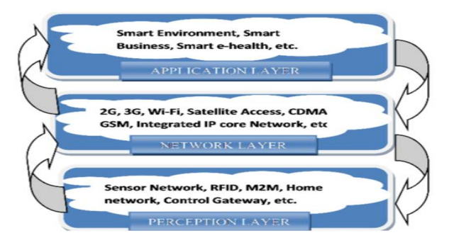
Fig.1 Architecture of Internet of Things

Internet is a global communication infrastructure that hosts billion of devices and enables the exchange of Exabytes of data per year. According to its design, the communication is between the data consumer and the data producer. This exchange of data mechanism is considered as host centric in nature: any information is strictly related to the location of nodes that make them available to the field of research, Information Centric Networking (ICN) has emerged as a revolutionary formulation. ICN communication is centric to information or the data rather than the host locations where