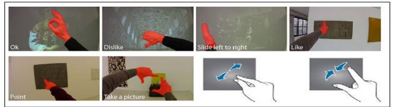
Fig 1: shows the different hand gestures which are given to the system to build the trained data set

In this we are proposing a semi-supervised action recognition for the touch less touch screen. Here the system is trained with the datasets. The trained dataset contains various labeled and unlabeled videos of various actions, action such has scrolling down which is represented by top to down action which is done by an hand, pen, pencil or any other stick, similarly left scrolling, right scrolling, down scrolling, up scrolling, zoom in, zoom out, increasing and decreasing of volume or brightness etc. is given as a trained dataset (fig.1). The action done by the users are recognized by the separate web camera. Here the usage of sensor is been eliminated. The actions which are being done by the users are recognized and compared with the trained dataset. This is done by extracting the features of both the action given by the user and that of the dataset respectively. Feature are extracted by SURF (speeded up robust features). The extracted features are been compared by PROSAC (progressive sample consensces).