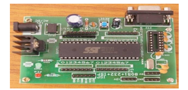
Fig2: SST89E516RD Microcontroller

The SST89E516RD is a member of the FlashFlex family of 8-bit microcontroller products designed and manufactured with SST patented and proprietary SuperFlash CMOS semiconductor process technology. The split-gate cell design and