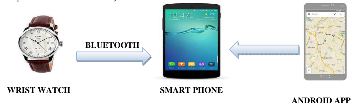
Fig1: Smartphone with application linked to watch

The hardware used in this system consists of an Android smart phone and a Wrist watch. The application is installed on the smart phone and the watch consists of an emergency button. As illustrated in Fig 1 the watch and smartphone are linked together via Bluetooth such that when the emergency button on the watch is triggered the application on the smart phone is turned on automatically and functions.