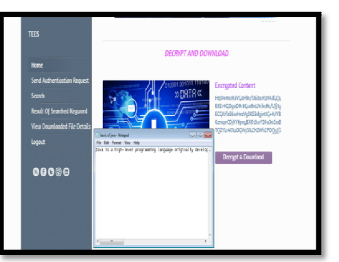
Fig (d) Data User Decrypting and Downloading Files

Fig (a) shows the Home Page of TEES consisting of 3 modules – Data Owner, Data Userand Cloud. The Data Owner has to click on the Data owner link in the Home Page to do his tasks. Similarly, the Data User has to click on the Data User link to login and search files.