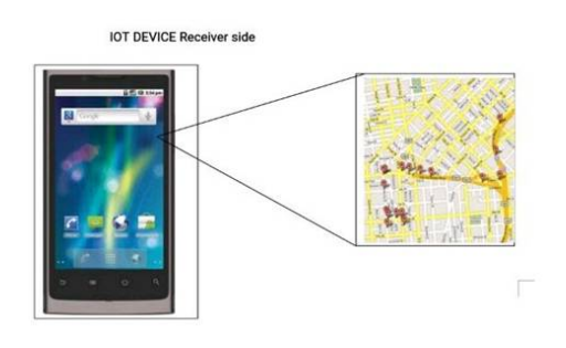
Fig 2: IOT device receiver side