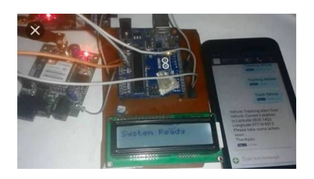
Fig 1: Displaying the command