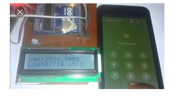
Fig 4: Getting outputs for the actions