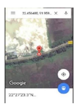
Fig 3: Location tracking using gps