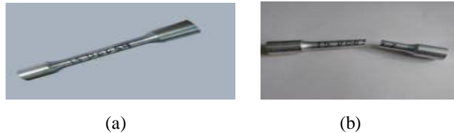
Fig 5. Tensile specimens before and after testing