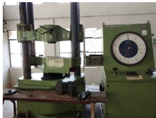
Fig 4. Universal Testing Machine

Universal Testing Machine is used for conducting the tensile tests on specimens prepared. Extensometer measures the key parameters of force and deformation, which can also be presented in graphical mode in case of computer operated machines. The specimen tested is shown in figure.3.