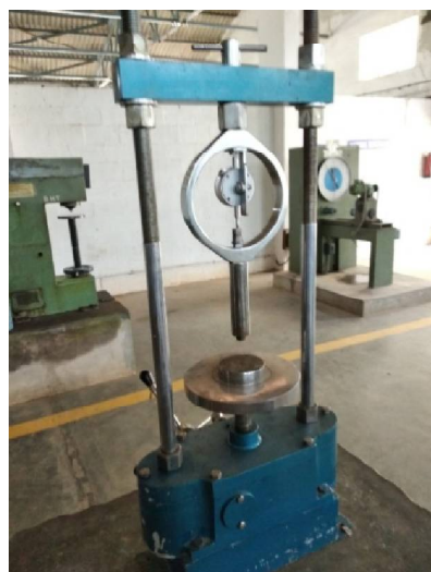
Fig 6. Brinell Hardness Tester

Specimen used for the test is shown in the figure 7.