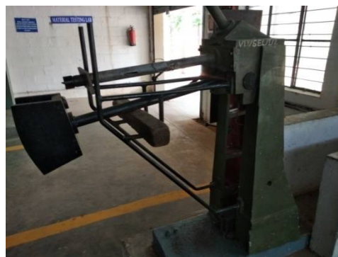
Fig 8. Impact tester

According to ASTM A370, the standard specimen size for Charpy impact testing is 10 mm × 10mm × 55mm. Sub size specimen sizes are: 10 mm × 7.5 mm × 55mm, 10 mm × 6.7 mm × 55 mm, 10 mm × 5 mm × 55 mm, 10 mm × 3.3 mm × 55 mm, 10 mm × 2.5 mm × 55 mm. Details of specimens as per ASTM A370 (Standard Test Method and Definitions for Mechanical Testing of Steel Products).