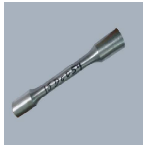
Fig 3. Tensile Specimen