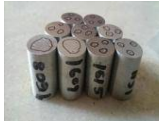
Fig 7. Hardness test specimen