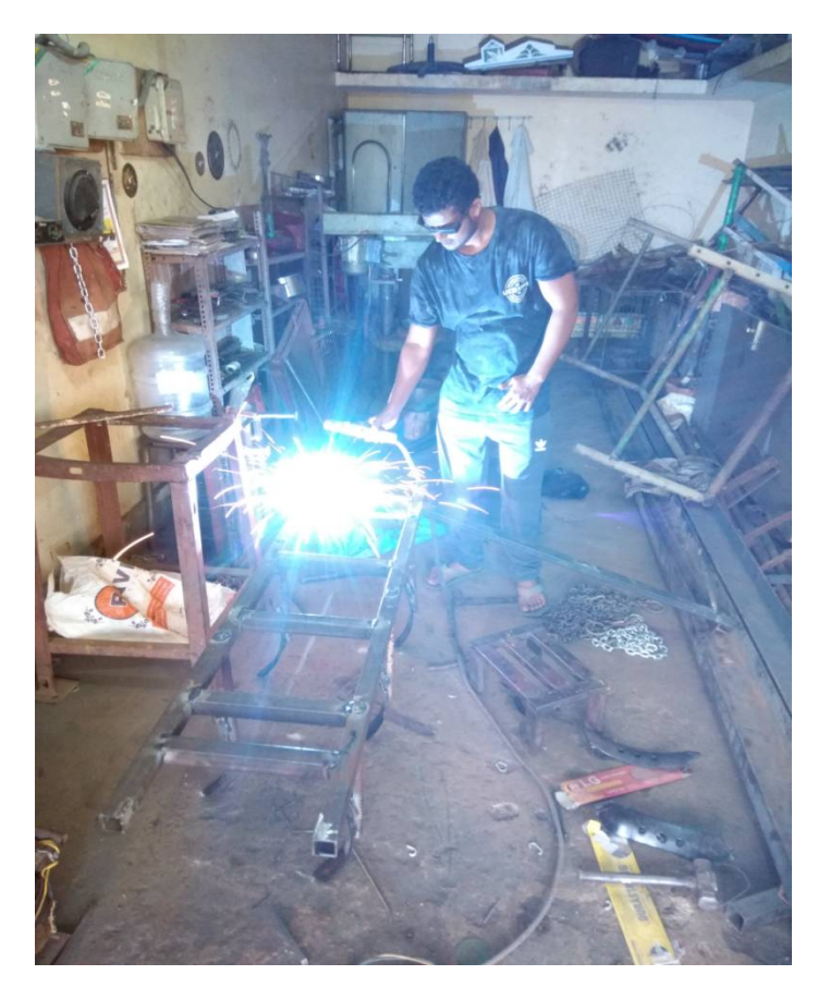
Fig 6.4 (Fabrication of cultivator)