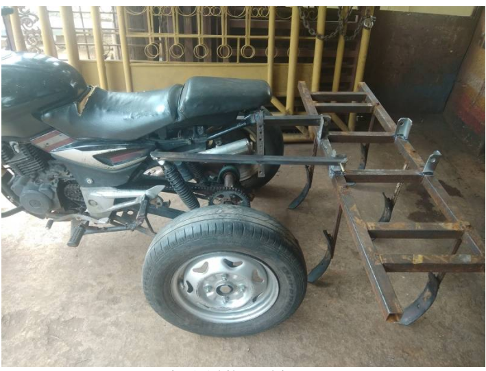
Fig 1.1 bike cultivator

Mini tractor was made in view of the small & individual farming need. It was made to eliminate the problems created by the usage of bullock carts in the fields. Mini tractors reduce the working hours of the farmers.