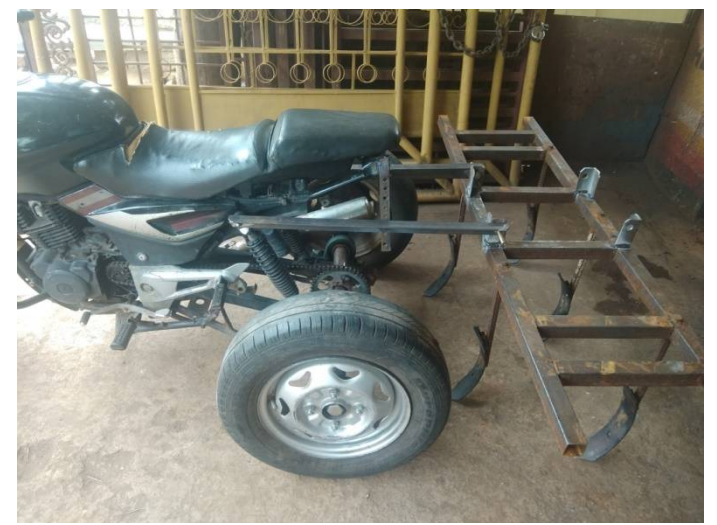
Fig 11. (Tyre replaced)