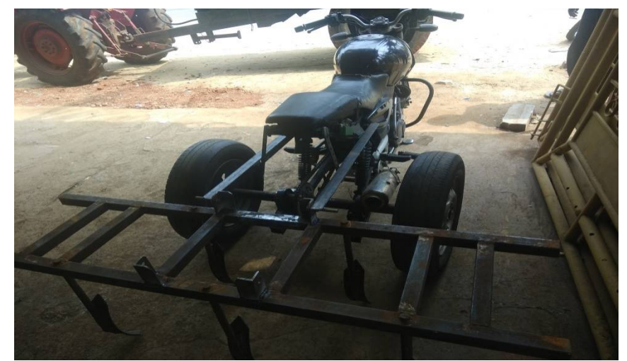
Fig 5.1: cultivator attached to bike

Tine cultivator is a perfect solution for stubble cultivation with an objective to provide a thorough and complete mix of soil and straw to the required working depth, incorporation of crop residues and organic fertilizer into the soil. Perfect machine for the stubble cultivation Tine Cultivator - perfect stubble cultivation implement suitable for light and medium soil conditions.