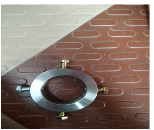
Fig 6.3 (chain sprocket)