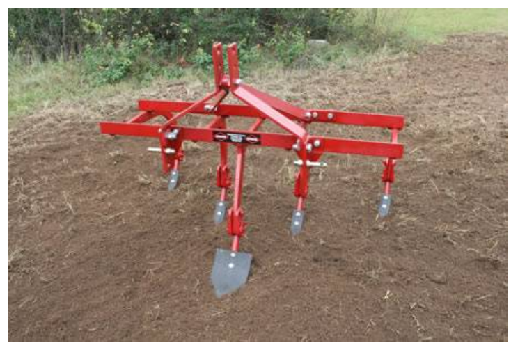
5.1b Cultivator fabrication

Department of Mechanical Engineering and Applied Science, Sri Krishna Institute of Technology, Bangalore, India