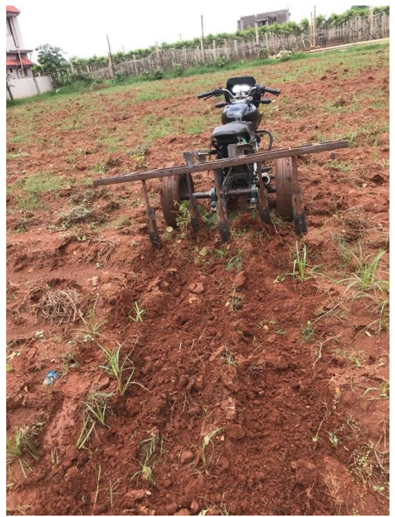
Fig 1.6 .Traction

Department of Mechanical Engineering and Applied Science, Sri Krishna Institute of Technology, Bangalore, India