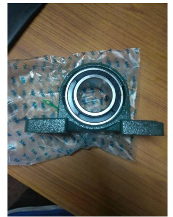
Fig 6.2 (plumber block)

An ISO 3297: 2007 Certified Organization