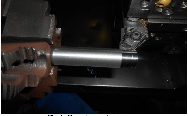
Fig 1: Experimental set up