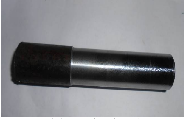
Fig 2: Work piece after turning