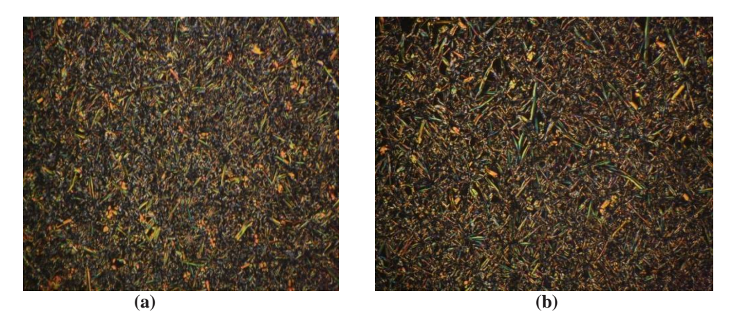
Fig. 1. Optical textures of (4-Pyridyl)-benzylidene-4'-n-Tetradecyl aniline (Py14BA): long-chain aliphatic carboxylic acid (FAs) nFAs (a) Smectic B phase in n = 12. (b)Smectic B phase.

The present image analysis deals with the transition temperatures of hydrogen bonded liquid crystals Py14BA: n FAs where n=12,14, and 16. Textures of these compounds are recorded using polarizing optical microscope in arthroscopic mode attached to the high resolution camera. The textures of liquid crystals are captured as a function of temperature, from the isotropic liquid state of the sample to the crystalline state. On cooling the isotropic liquid of hydrogen bonded liquid crystals (HBLC) complexes, Py14BA: n FAs exhibits monotropic nature in the case of (n=12,14) and found to bear glossy focal conic fan textures shown in Fig 1 which is noticed as Smectic B crystal phase while n=16 exhibits enantiotropic nature with glossy focal conic fan texture Smectic B crystal phase and marble threaded texture of Smectic F phase shown in Fig 2. The SmF phase exhibited by Py14BA:16FA remains till ambient (~30°C) temperatures in the cooling cycle. The data of transition temperatures and the LC phases identified by the present POM textural changes in heating and cooling cycles are presented in Table 1.