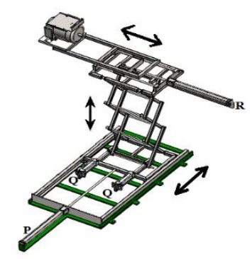
Fig. 1. Semi-automatic retractable scissor lift

Various automated systems like chain conveyor [1], belt and bucket conveyors [8] and pick and place robots [7], used in the industry were studied. Kinematics of the equipment was decided based on the availability of space in the industry and study of various simple mechanisms [12]. Though, precision is not good in pneumatic cylinders due to the compressibility of gasses [5], pneumatics was decided to be used as it is readily available in the industry. Industrial automation systems were studied [13]. Owing to high costing, semi-automation was decided to be used. 3D modelling was done using Solidworks 2015 software. The isometric view of semi-automatic retractable scissor lift is shown in the figure 1. Figure clearly shows 3 kinds of motion in the semi-automatic retractable scissor lift, that are: one translatory motion along the piston rod axis of cylinder P, another translator motion along vertical axis & third translator motion along the piston rod axis of cylinder R. In addition to the components shown in the figure, the design consists of pneumatic cylinders, slider, slider holder, scissor lift, trolley, guide wheels, rail, electronic kit, proximity sensor, solenoid valve and flow control valves.