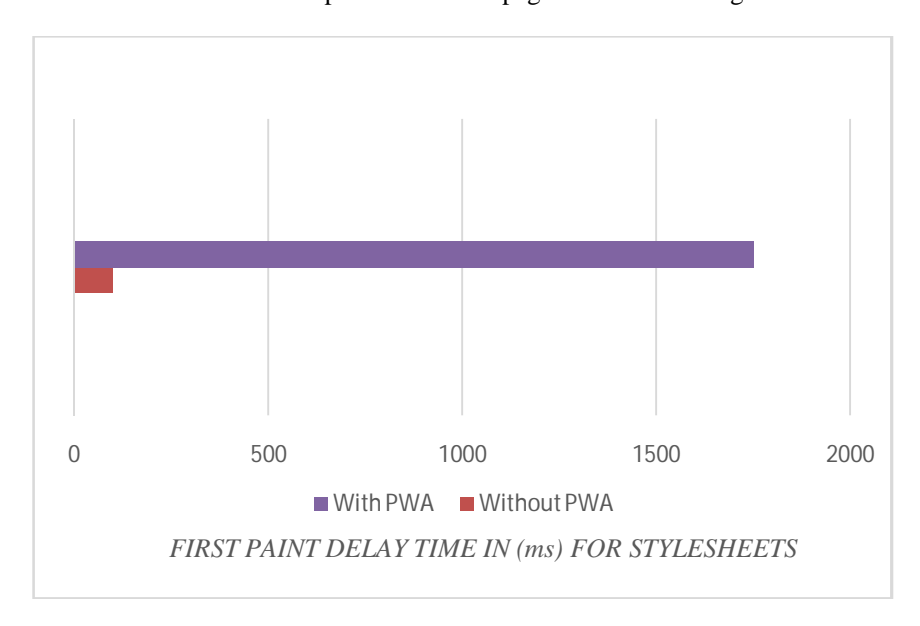
FIG 2: FIRST PAINT DELAY TIME

First page is the first point where the browser has all the information that it needs to render the page. This is with reference to the first time the browser will paint an image of the rendered page on the screen.