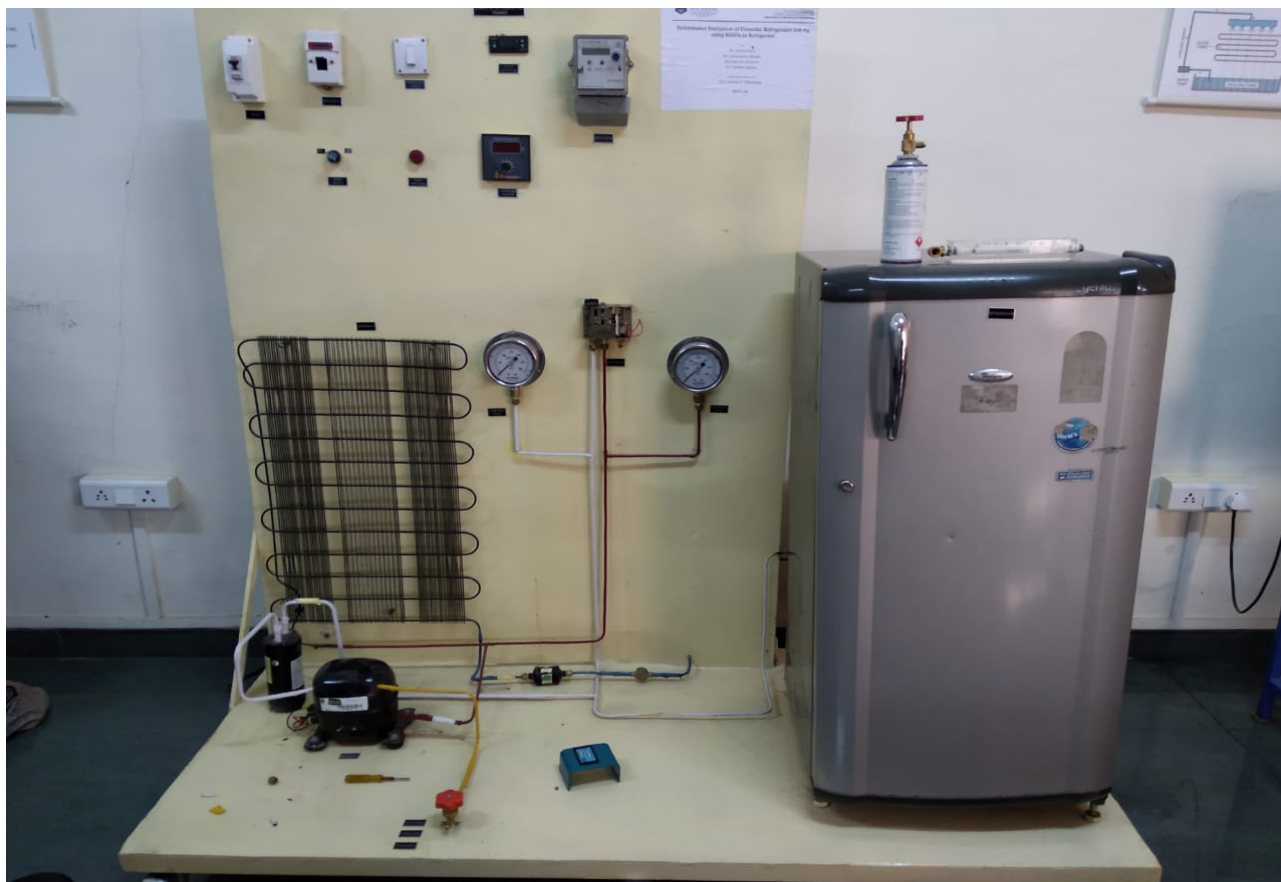
FIG NO 1 : Experimental Setup

The refrigeration test rig works on vapour compression cycle. The refrigeration is accomplished by continuously circulating, evaporating & condensing fixed supply of refrigerant in a closed system. Evaporation occurs at low temperature & low pressure to an area of high temperature. The compressor pumps the low pressure refrigerant from the evaporator, increases its pressure & discharges the high pressure gas to the condenser. In the condenser, the refrigerant rejects its heat to the surrounding by passing air over it. In the condenser at pressure, the refrigerant loses its latent heat & liquefies. Then the refrigerant passes through the drier filter where any residual moisture or foreign particles present are plugged, the flow of refrigerant into the evaporator is controlled by an expansion device where the compressor draws the cold vapour & the cycle repeats.