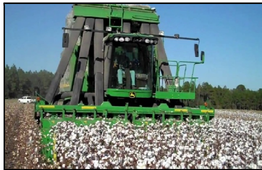
Fig.2 MULTIPLE ROW BIG BASKET COTTON PICKER

As Per problem we decide to make Portable Hand Held Cotton collector. This portable cotton collector has specific mechanical arrangement so that cotton from each boll can be picked and collect in trolley. In our machine two rollers and one protecting grill are fixed between two aluminium plates. Motor is connected with backside roller. And both rollers are connecting with belt to each other. At last nail is fixed in belts.