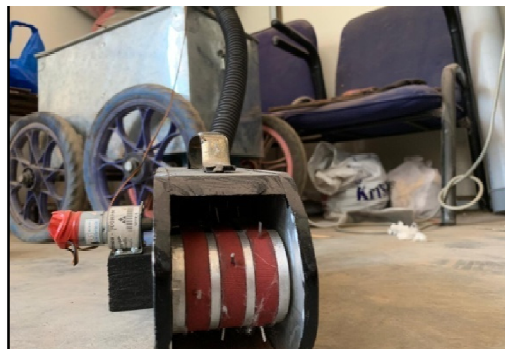
Fig.5 ACTUAL MODEL OF PORTABLE HAND HELD COTTON