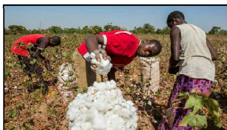
Fig.1 MANUAL PICKING IN 1920