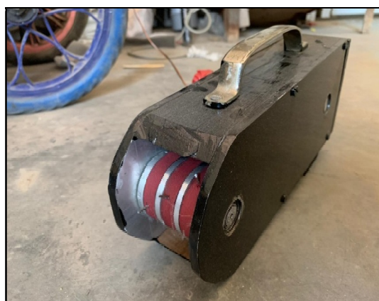
FIG.5 MECHANISM IMAGE OF PORTABLE HAND HELD COTTON COLLECTOR TO COLLECT THE COTTON FROM EACH COTTON PLANT