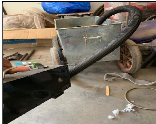
FIG.6 MECHANISM CONNECTED WITH VACCUM