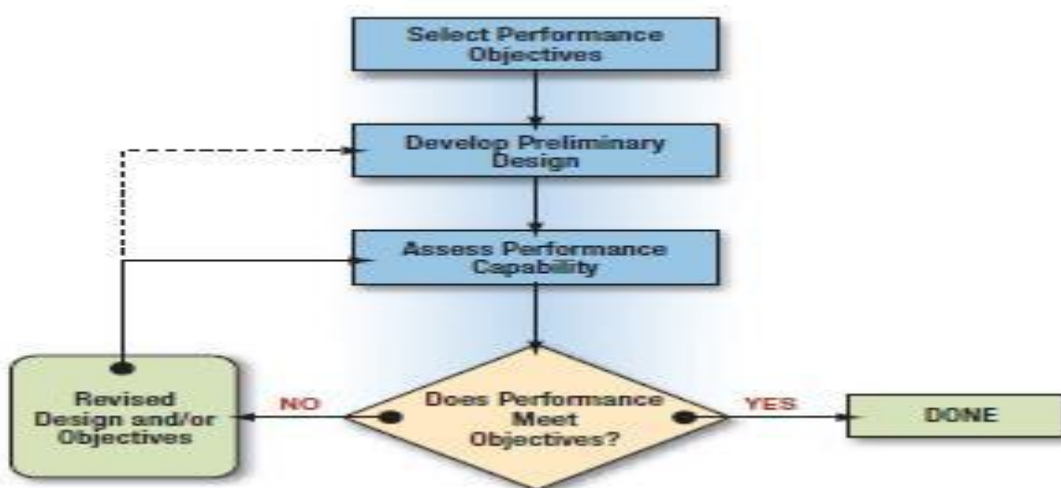
Figure 1.1: Flow Diagram showing Performance Based Design