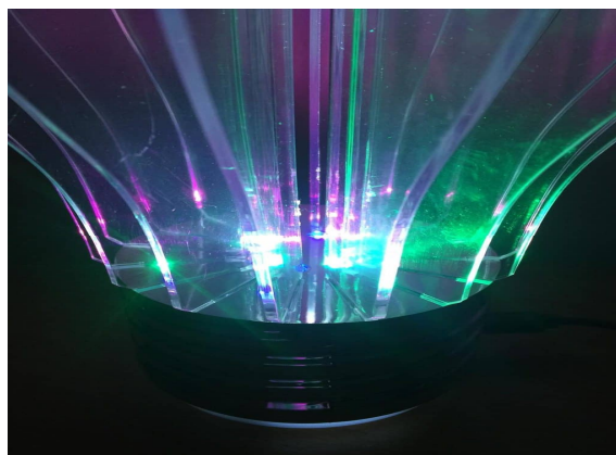
Fig c ambient light for changing the patient mood