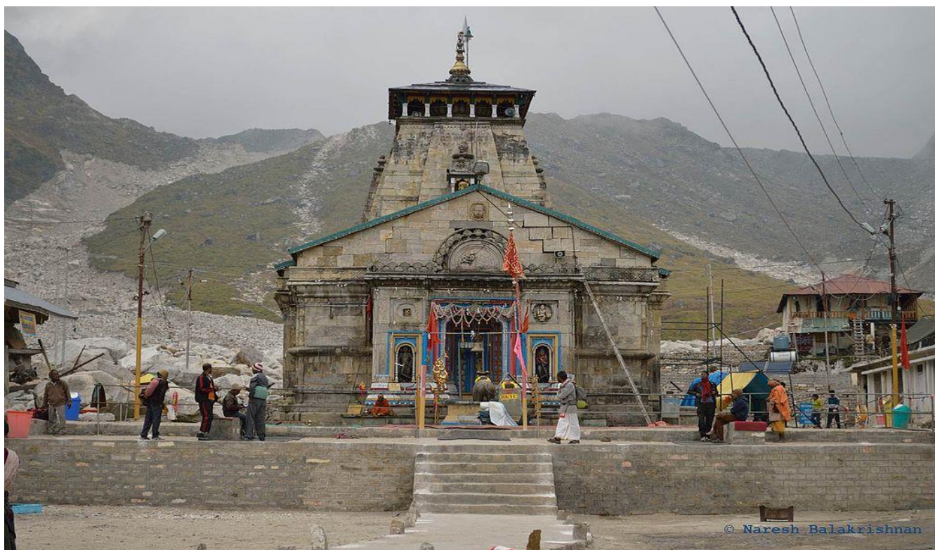
Kedarnath Temple is one of the 12 Jyotirlingas

At Thermo Fisher Scientific, our solutions include high availability samplers, elemental and particle size analyzers, and bulk weighing and monitoring equipment. Shaped by decades of working with the copper mining industry, this technology enables optimization of mine life and plant feed grade, yield, efficiency, and the profitability of copper mines and concentrators. Ultimately, our technology helps to make clean energy greener. Decarbonization is not all. However, pressure from investors is growing and the social license to operate is getting harder to negotiate. Copper mines must reduce their environmental footprints and the intensity of water and/or power consumption. Furthermore, the concentration or grade of copper in economically viable deposits is decreasing. [5,6]