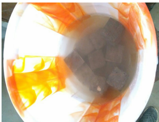
Fig. 4. Specimens in acid curing