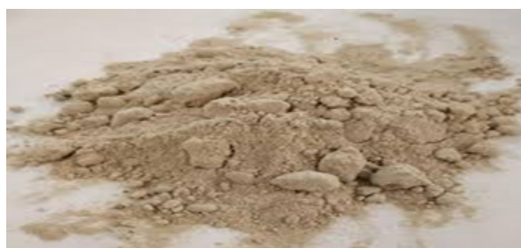
Fig. 1. Phosphogypsum