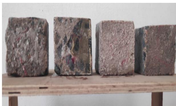
Fig. 5. Specimens after acid curing