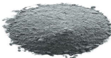
Fig. 2. Fly ash