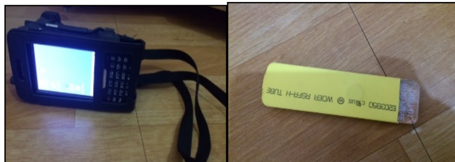
Fig:-RFID Reader and Tags

RFID:- Stand-alone radio frequency identification (RFID), like bar coding, is also an automated data collection (ADC) technology. An RFID tag is a portable memory device located on a chip that is encapsulated in a protective shell and can be embedded in any object which stores dynamic information about the object. Tags consist of a small integrated circuit chip, coupled with an antenna, to enable them to receive and respond to radio frequency queries from a reader. Reading and writing ranges depend on operation frequency (low, high, ultra high, and microwave). Low frequency systems generally operate at 124 kHz, 125 kHz or 135 kHz. High frequency systems operate at 13.56 MHz and ultra-high frequency (UHF), and use a band anywhere from 400 MHz to 960 MHz. Tags operating at Ultra High Frequency