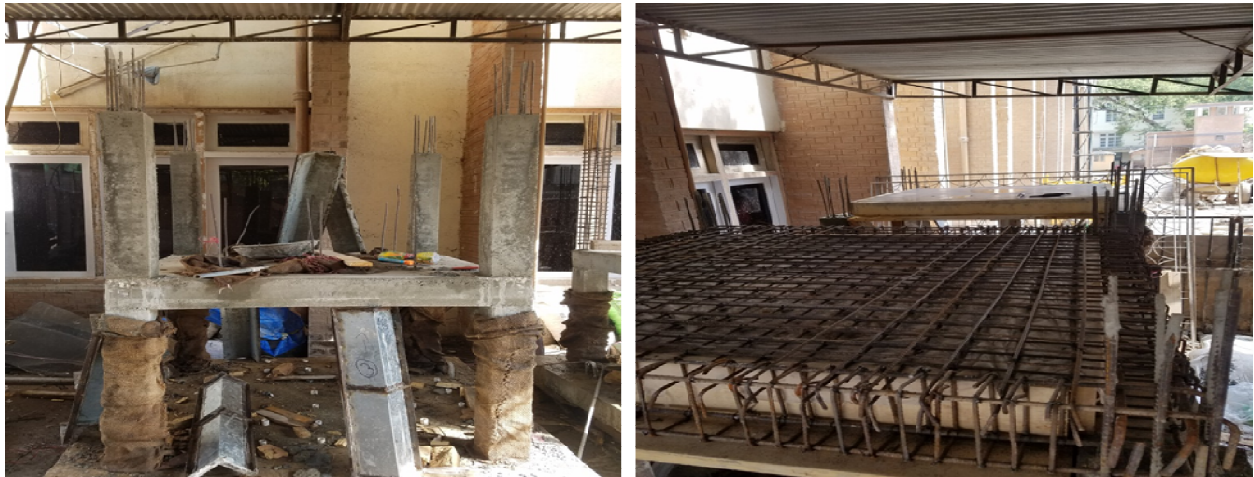
Fig5: Preparation of First Floor columns and slabs