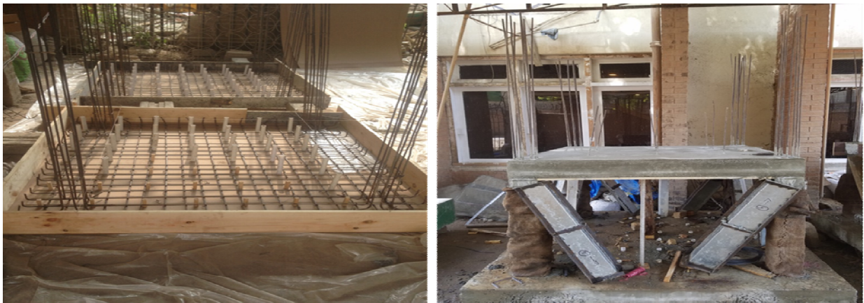
Fig 4: Preparation of foundation pads and Ground Floor columns

Steel formwork was used for beams and column while wood formwork was used for slab construction. After completing construction of models, plain cement concrete blocks were constructed at each floor for simulating additional masses so that vertical stresses in prototype becomes equal to vertical stresses in model which is a similitude requirements as suggested by Quintana-Gallo et al (2010) [12]. The various stages of construction are shown in Fig. 4 and 5.