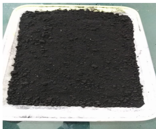
Fig 3:Rubber particles used in CRC

After finalizing the design of structural model, its preparation was started in casting yard by first constructing two reinforced concrete foundation pads of dimensions 5'-6"×5'-6" and having thickness equal to 6" and reinforced with #2 deformed bars at 2" c/c in both directions. Vertical holes were lift in foundation pads in the form of PVC pipes of diameter 1" so that it may be fixed on shake table with the help of nuts and bolts. After 7 days curing of the foundation pad, the position of frame columns were marked on it and the column reinforcement cages were erected. One structural model was prepared from usual concrete and the other one was prepared from rubberized concrete which was made by replacing 15 % fine aggregates by rubber particles shown in Fig. 3.