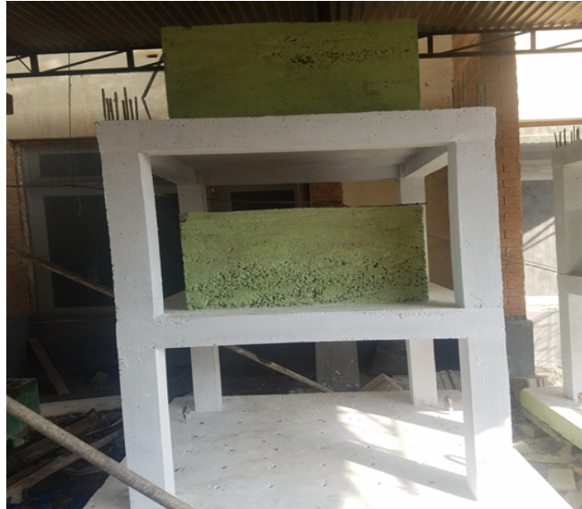
Fig 6:Complete structural model after white washing