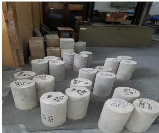
Fig 7:Standard concrete cylinders

During the construction of structural models, a total of twenty four number standard concrete cylinders (twelve from usual concrete and twelve from rubberized concrete) were prepared from each batch of concrete to find their compressive strength and the difference between compressive strength of usual concrete and rubberized concrete. The cylinders prepared are shown in Fig. 7.