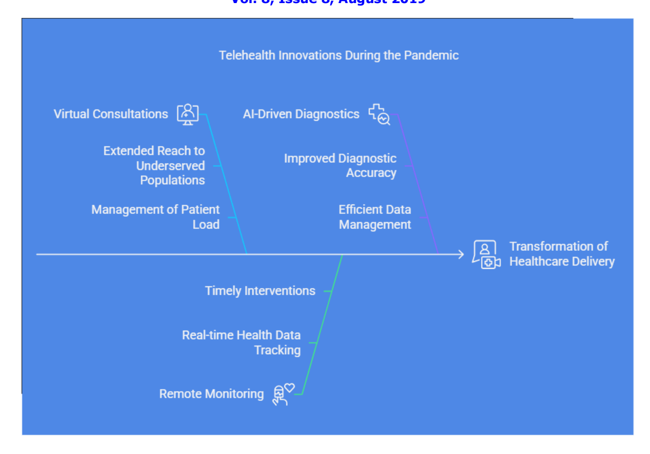
Figure 3: Telehealth Innovations During the Pandemic

Website: www.ijirset.com Vol. 8, Issue 8, August 2019