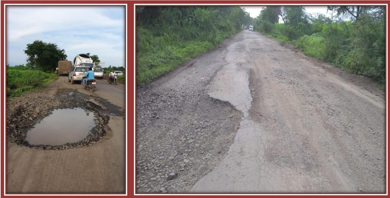
Fig. 4: Potholes & Poor Road Condition near Torkheda Village. Tal. Shahada (M.S)

This Poor Road Condition is responsible for Accidents and lives Risks to the users using daily. The Whole Stretch of 378 Km is damaged and Concern PWDs are not paying attention on the Problems arising daily using this road. The Carelessness of Govt. is leading life threat to the people travelling through it. The Journey has increased due to this damaged road and Transportation System is delayed due to that.