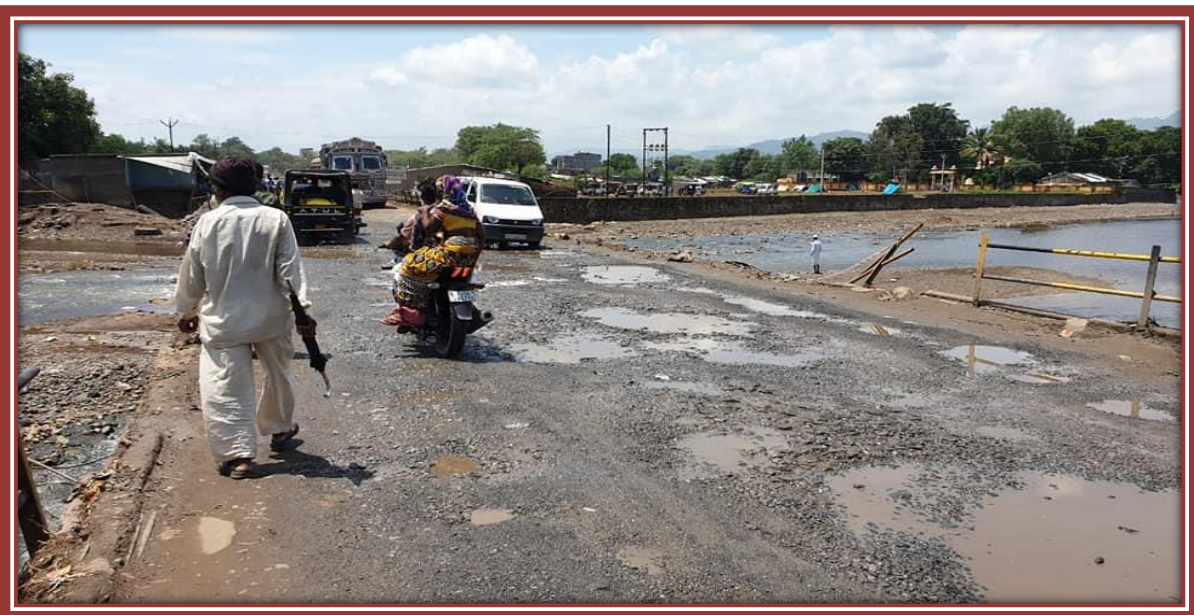
Fig. 3: Guard Railings Damaged on Bridge near Akkalkuwa (M.S)