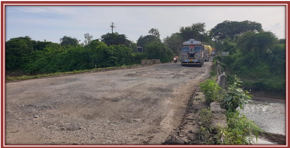
Fig. 2: No Guard Railings Provided for Safety on Bridge near Akkalkuwa (M.S)

The procedure for identification of hazardous locations is called as black or dead spots.