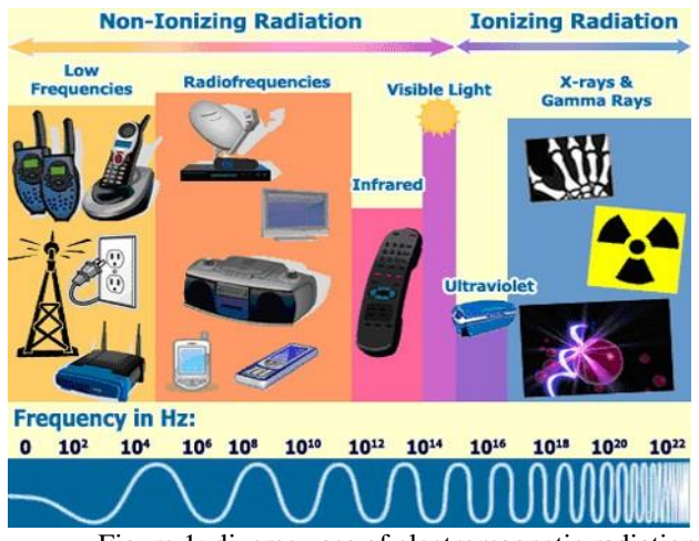
Figure 1: diverse uses of electromagnetic radiation

The rapidly evolving mobile phone technology raised public concern about the possibility of associate adverse health effects. The telecom sector is providing millions of jobs in the world but it is also giving cancer and other serious health problem to billions of people besides causing harm to birds, animals, plants etc. to the living world. It is not only fastest growing industry but it is also creating fastest growing health problems. Many people are increasingly concerned about the possible health effects due to frequent, long term use of cell phone and the radiation. As year after year immense numbers of users of mobile phones, even small adverse effects on health could have major public health implication. Traffic accidents caused by using telephone during driving are another public challenge. Mobile phones are often prohibited in hospitals and on airplanes, as the radiofrequency signals may interfere with certain electro-medical devices and navigation systems. In addition to the context of Nepal, as six voice telecom operators, more than 30 ISPs, more than 320 FM stations, more than 35 Television channels and one AM radio are already in operation, it is already high time to explore the signal level and develop the guidelines to minimize the health hazard from the electromagnetic radiation of wireless communication.