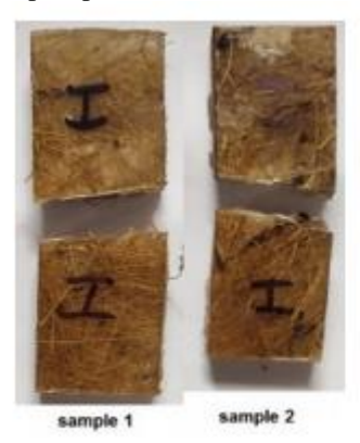
Fig.4: Impact test specimen

Izod impact test specimen were prepared in accordance with ASTM D256-97, to measure the impact strength. The specimens are prepared to dimensions of 64 \times 12 \times 9 mm width. A V-notch is provided having an included angle of 45^0 at the centre of the specimen and 90^0 to the sample axis. The depth of the notch is 2mm, the samples were fractured in plastic impact testing machine and the impact strength of the sample specimen have been evaluated. The sample specimens after impact testing is shown in Fig.5. Table 2 shows the impact values of two sample specimen with different fiber volume fraction.