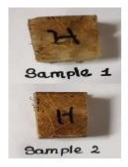
Fig.4: Hardness test specimen

Abrasive wear or erosion and thermal deformation are caused by reduced hardness of the material therefore it is important to identify the sample with greater hardness. The two samples as per in ASTM standard (ASTM D2240) as shown in Fig.4 are subjected to Hardness test using Shore D Micro hardness tester. Each samples was tested at three locations with the specimen being subjected to a load of 0.5 kg for a dwell time of 10 seconds for each location. Table 1 shows the hardness values of two sample specimens with different fiber volume fraction.