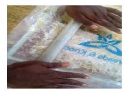
Fig.1 (c): Surface finishing of sample