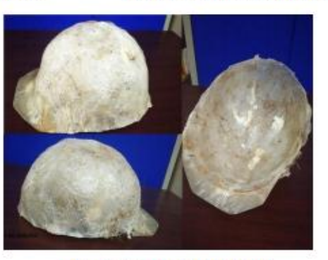
Fig.3: Fabricated Helmet shell