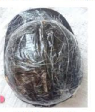
Fig.2: Prepared pattern