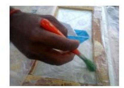
Fig.1 (a): Applying release gel

(A High Impact Factor, Monthly, Peer Reviewed Journal) Visit: <u>www.ijirset.com</u> Vol. 8, Issue 12, December 2019