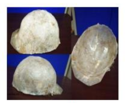
Fig.6: Fabricated helmet shell