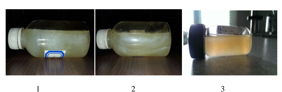
Figure 4. External visibility of some "IKHLAS" LCND samples from bottles in vertical and horizontal positions: 1 - "IKHLAS" LCND- 6003-20; 2 - "IKHLAS" LCND-5003-15; 3 - "IKHLAS" LCND-4003-10.