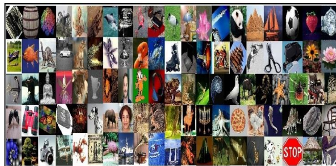
Figure 1. Sample images of Caltech – 101 Dataset

Caltech-101 dataset is the overall collection of images that is used in our project containing 101 rows of images with each row containing set of images varying from 40-55 images in each row. Totally containing 9,165 images in whole. Each row contains set of images like Accordion, Anchor, Bonsai, Trees, Fishes, Aeroplane, Barrel, Binocular and much more.