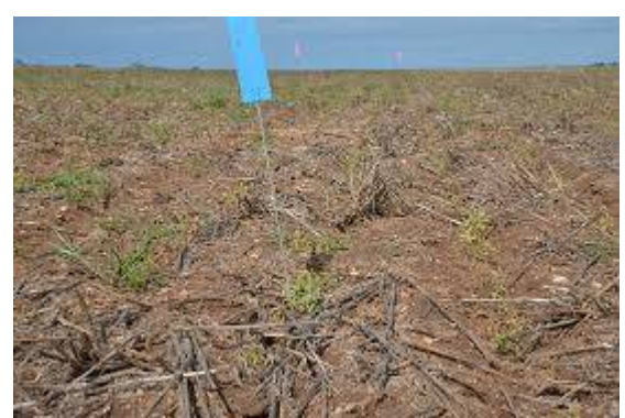
Fig. burnt plants after using more pesticides. (ref no. 1)

The regular condition of soil is sandy and the silt is maximum so that the soil water holding capacity is too poor. Those effects on the quality of decreasing in the physical and chemical properties therefore the physic-chemical analysis is necessary because of that the current condition is define and the quality should help to decide the supplements. The use of chemical fertilizer is increasing that makes the soil infertile because of that chemical fertilizer the toxic chemicals are remains in the soil properties that again goes in the plants which may harm the human body. in this paper they did the analysis in which they includes the testing of pH EC ,organic carbon , total nitrogen , phosphorous , potassium and with this the particle size distribution results are done in that there are mainly rocky soil is present the rocks are large , silt is intermediate , and clay is very fine . This paper gives me the idea about the total types of soil available in the yavatmal district .