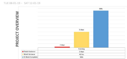
Graph 3. Overall project view (case study)