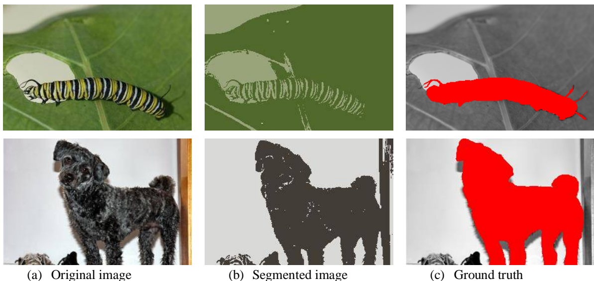
Fig.1 Result of K-means segmentation method

Fuzzy clustering techniques like Fuzzy C means, Gustafson-Kessel, Gaussian mixture decomposition are used when there are no crisp boundaries between objects in an image. Fuzzy C means is the most popular soft clustering method.