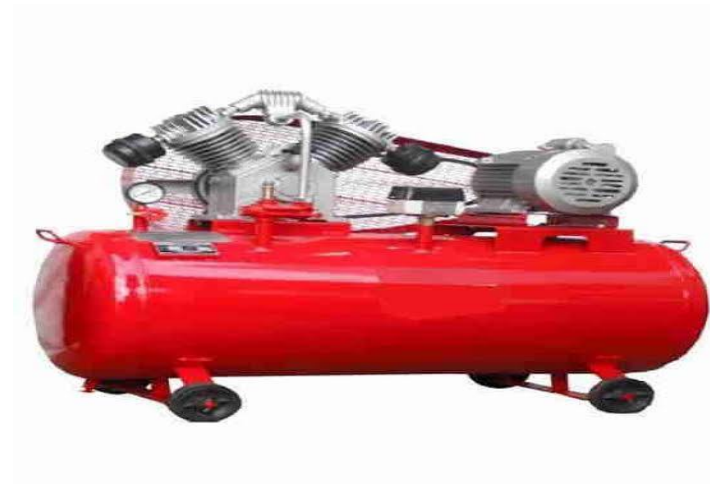
(Fig 8) Compressor used to compress the air and supply it to the machine