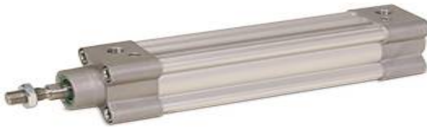
(Fig 4) Double acting cylinders used in the compression process