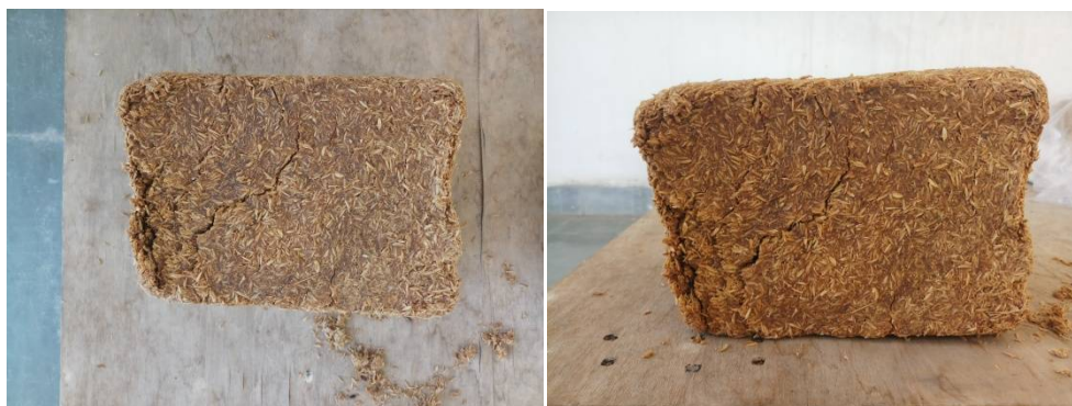
(Fig 3) Rice hush bricks after the compression/briquetting process