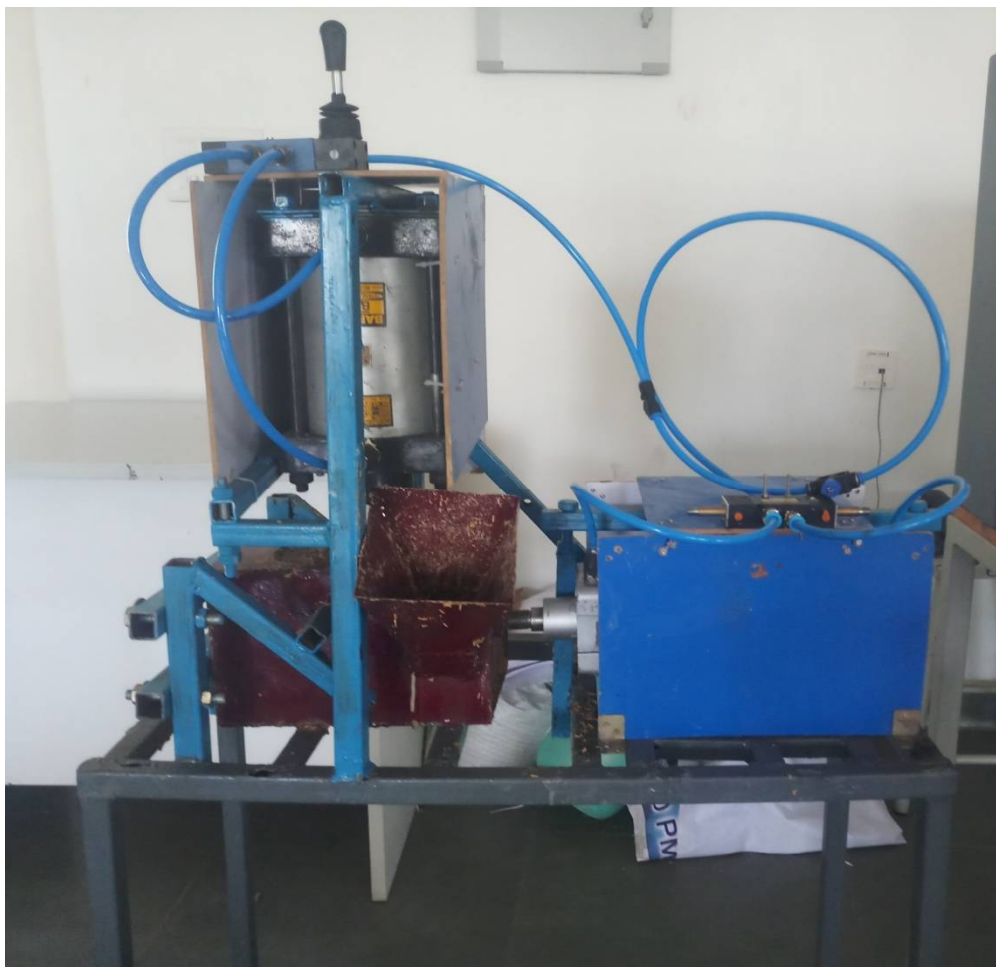
(Fig 9) Compacting Machine which produces Rice husk bricks