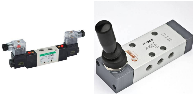
(Fig 5) 5/2 pneumatic DC valve and hand lever used to control path of the air flow

5/2-way valves are used to actuate double acting pneumatic actuators, such as cylinders, rod less cylinders, grippers and rotary actuators. Double acting actuators require compressed air to move in both directions. To decide whether a mono-stable or bi-stable 5/2-way valve should be applied, it is necessary to know more about the system's design and requirements.