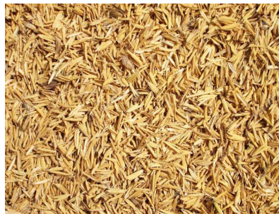
(Fig 1) Rice husk produced in rice mill by separating the husk and rice