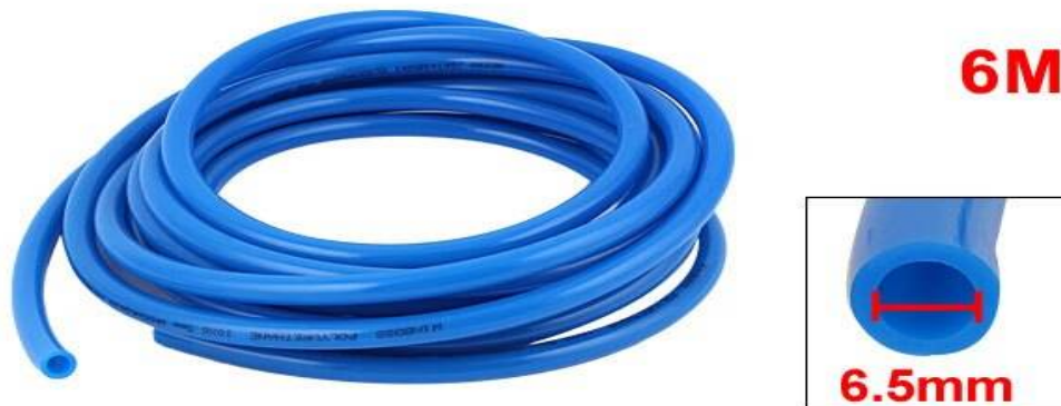
(Fig 6) Pneumatic pipethrough which the air flows