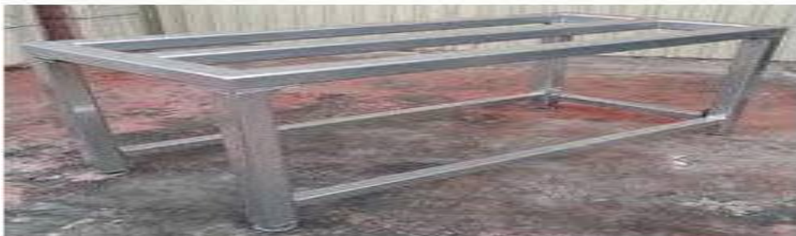
(Fig 7) Ms Square Fabrication Base used to hold the entire load of the machine

Metal fabrication is the process of turning raw metals into pre-made shapes for assembly use. For example, the panels that comprise the frame of an automobile are made through custom metal fabrication processes, which are usually performed at a fabrication facility and then sent to an auto assembly plant.