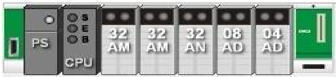
Figure : 2. PLC hardware configuration with expansion module rack based

a) PLC : Programmable logic controller belongs to main controlling family & here used modular PLC(AH series -AHCPU500-RS2). It is a basic CPU module with two built-in RS-485 ports, one built-in USB port, rack based PLC and one built-in SD interface. It supports 768 inputs/outputs. The program capacity is 16 ksteps. The programming languages which are supported are instruction lists (IL), structured texts (ST), ladder diagrams (LD), sequential function charts (SFC), and function block diagrams(FBD). I used ladder diagrams as per the process