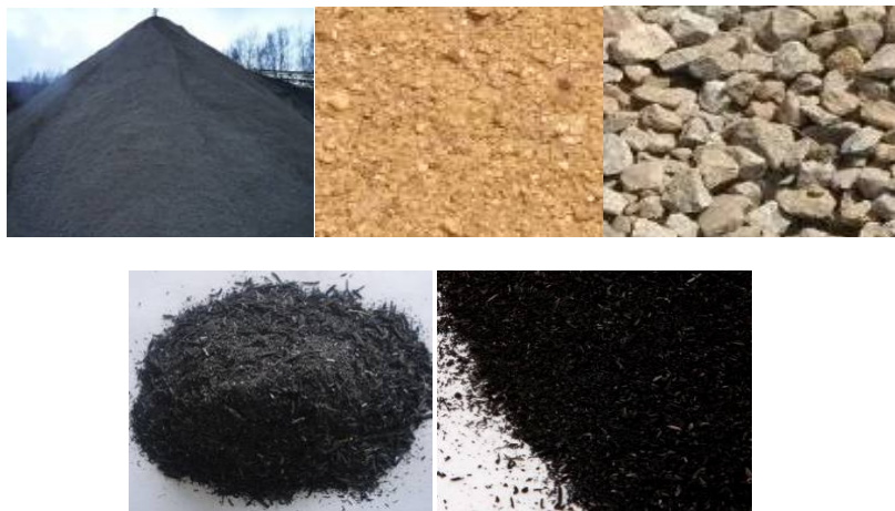
Fig1. Composition of Materials

Water available from the local sources conforming to the requirements of water for concreting and curing as per IS: 456-2000.