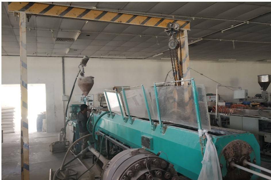
Fig (3.1) :Conventional crane in Kundan pipes

In Kundan pipes, they are using mechanical crane for using changing and transmitting of die set to the store room. In that way it will take much time ,need more space and labours are required during changing die set that shown in below figure.