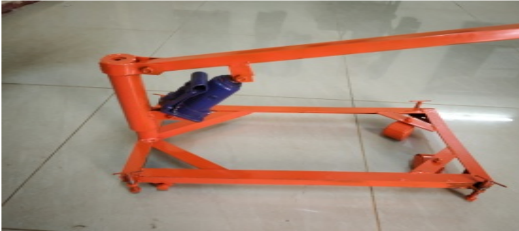
Fig (6.3): fabricated model of moveable hydraulic jockey