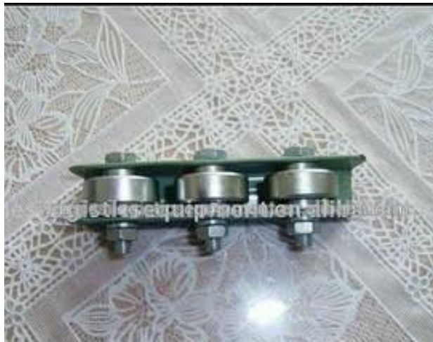
Fig( 6.1 & 6.2): wheel bearing