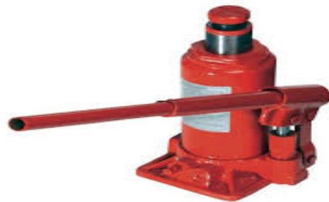
Fig(6.4 & 6.5) : Jockey and Link chain